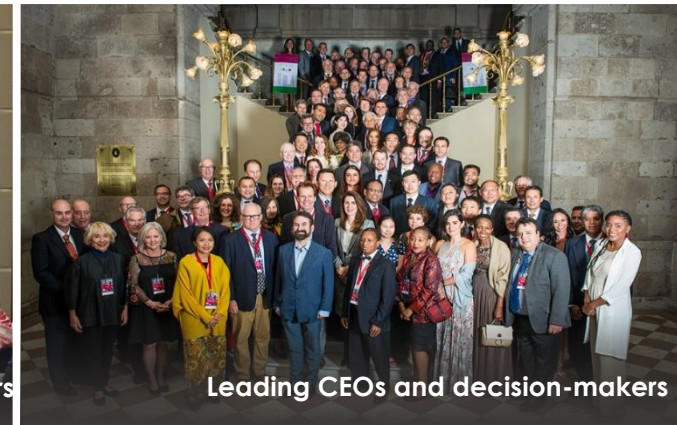
Leading CEOs and decision-makers