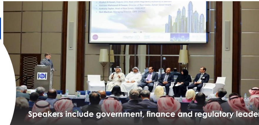
Speakers include government, finance and regulatory leaders

3 days of Seminars, meetings and networking events