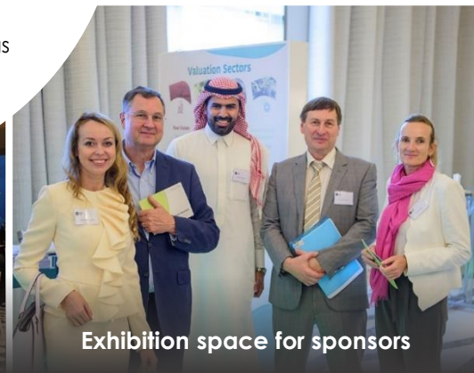
Exhibition space for sponsors