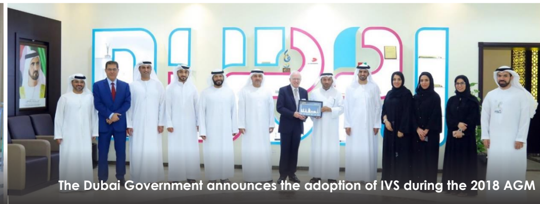
The Dubai Government announces the adoption of IVS during the 2018 AGM

The IVSC AGM is the only event of its kind to convene the world's leading valuation experts and influencers in one place to focus on advancing global standards and professionalism in all aspects of valuation. Uniquely, the IVSC AGM brings together decision-makers from all facets of the global valuation profession, including regulators, service providers, professional bodies and end users.